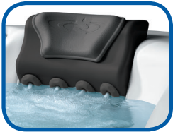
Jet Therapy Pillow