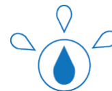
ClearZONE® Pro (Optional)